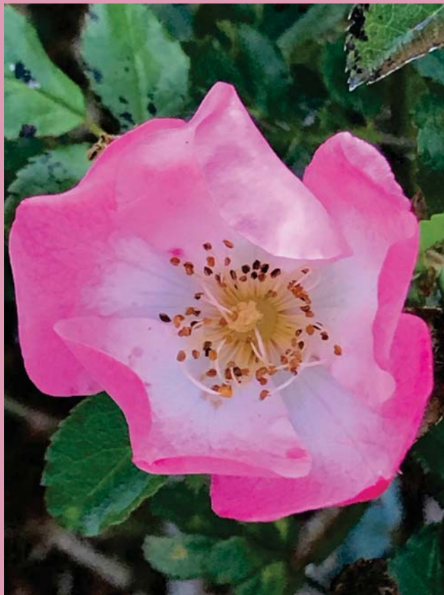
California Wild Rose

A universal challenge I notice among well-intentioned stewards of Earth energy is the habit of over-intellectualising the problems that are arising through humankind's exploitation of Nature. Turquoise helps us to align the channels of Earth and Spirit with deep reverence and wisdom. This gem supports a higher masculine consciousness, which serves the Divine Feminine from a place of grounded awareness. From here, we are able to maintain a deep connection to Earth that truly reflects our responsibility.